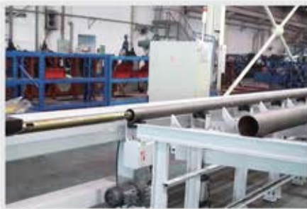
Automatic pipe loading, feeding mechanism