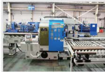
Pipe cutting station