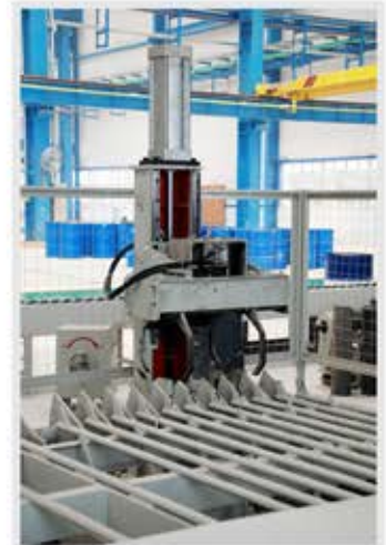
Pipe automatic aligning and feeding device