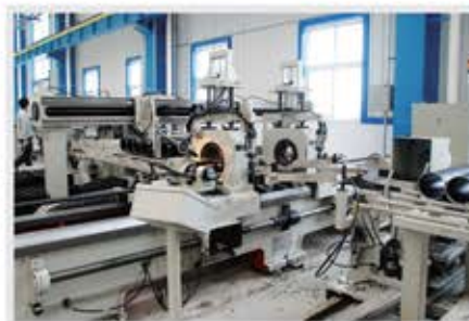
Pipe turning station and cleaning device