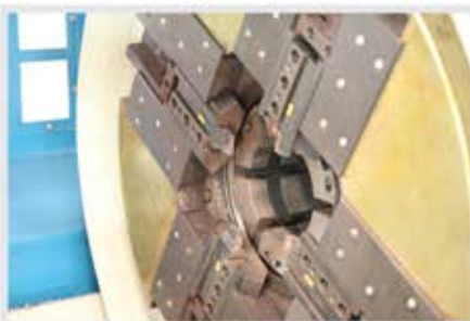
Four-tool high speed cutting